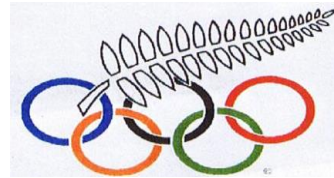
New Zealand Olympic Committee